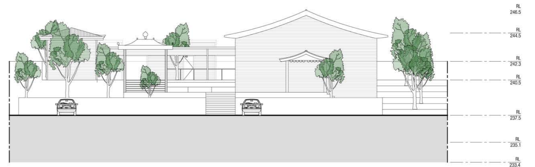
Internal Car Park Elevation 1:200@A2