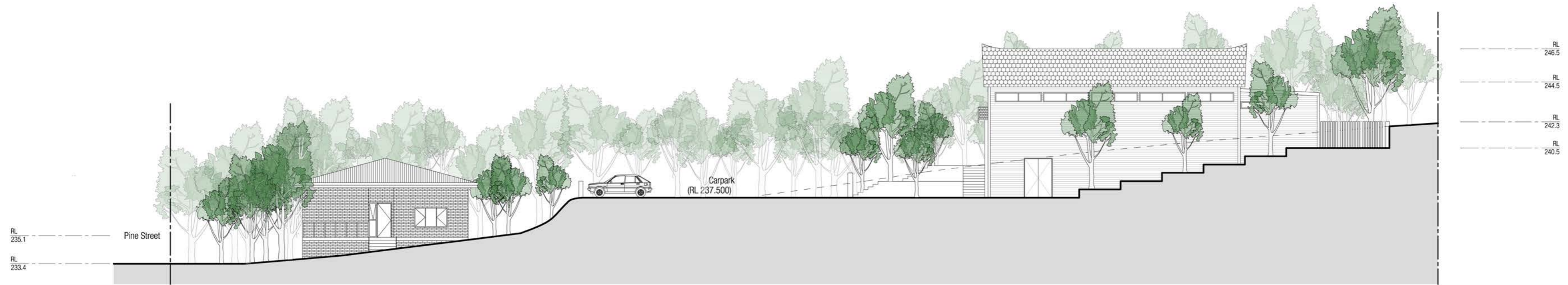
Neighbour Property No. 18 Boundary Elevation 1:200@A2